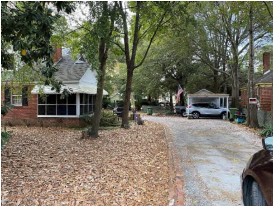
View from street.