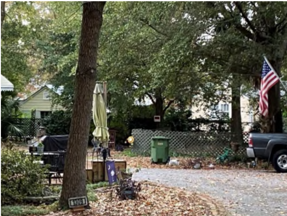
The building will be sited where the latticed area is.