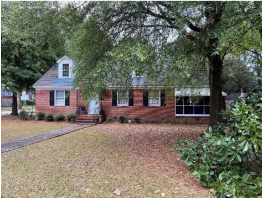
Front of house from West Palmetto Street.