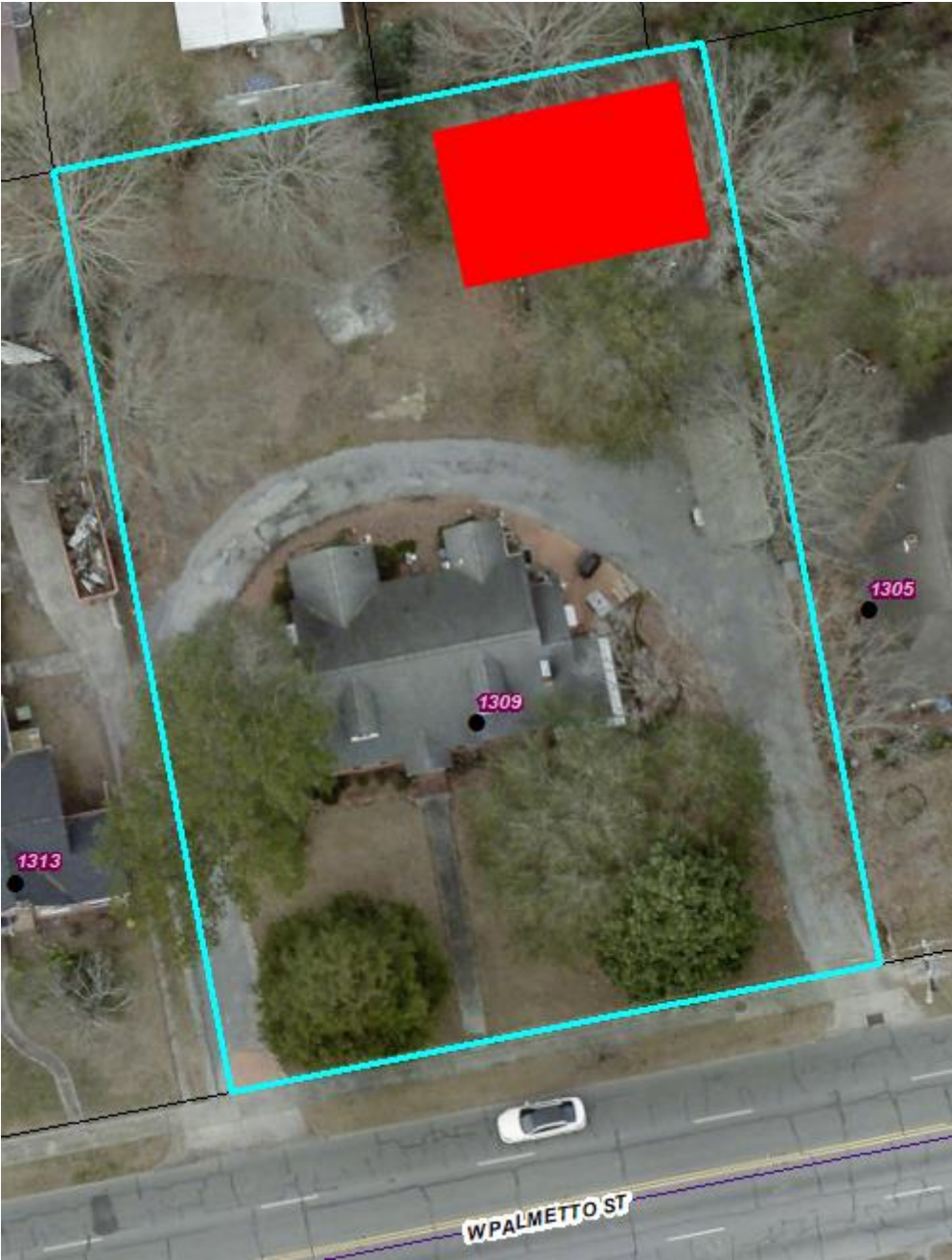
45 feet wide by 30 feet deep set 5 feet from property lines