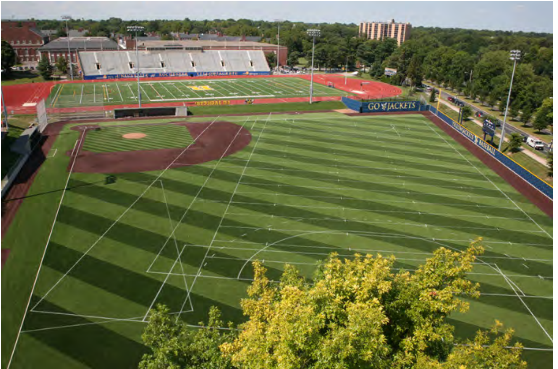
Multi-purpose ball fields