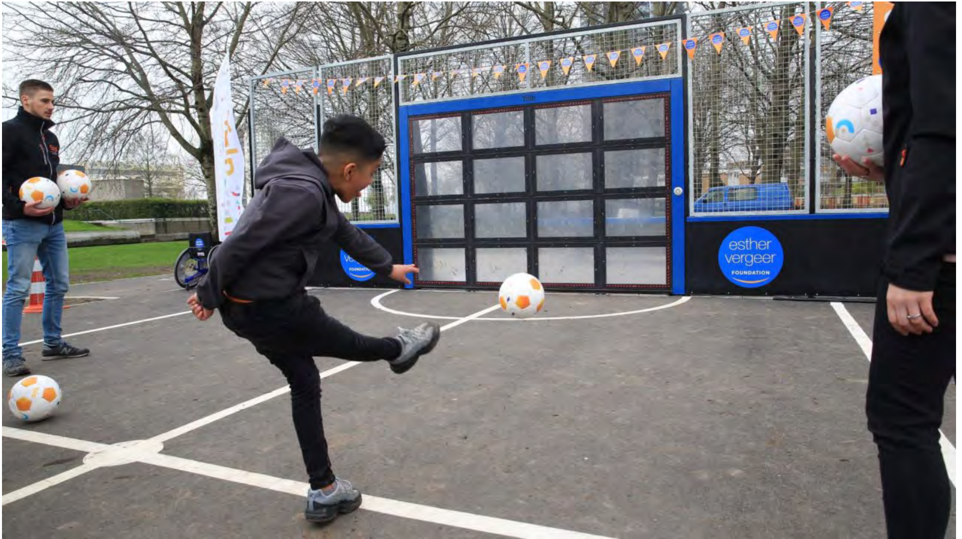
Interactive skill-building stations (wall lights when hit)